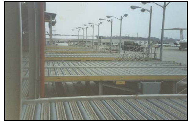
Powered Roller Decks

Webb-Stiles Air Cargo Conveyors are in use by many air cargo customers, including the U. S. Air Force and Naval Defense Departments.