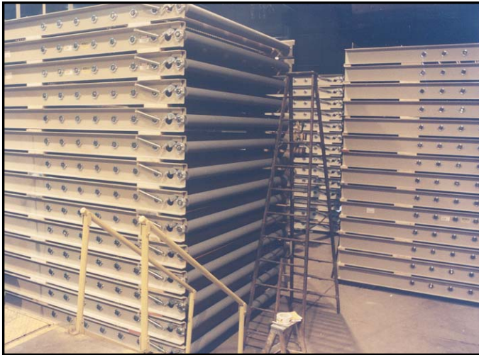
Conveyor Roller Beds Ready for Shipping