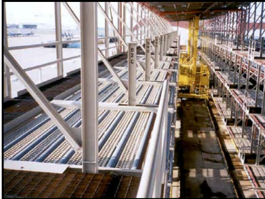
Typical Air Cargo Storage System