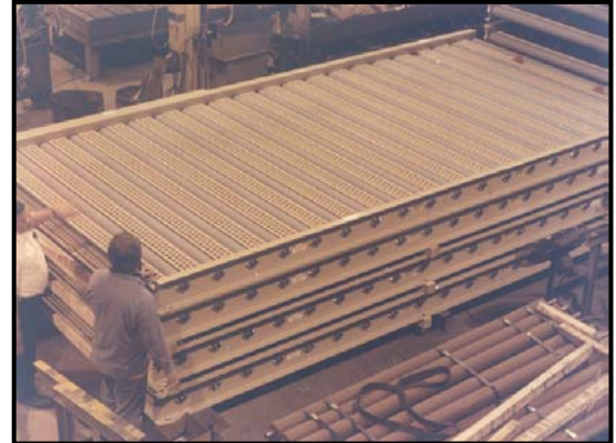
Typical Air Cargo Roller Deck

Webb-Stiles Air Cargo Conveyors are built to handle all types of air cargo containers. Our standard line of roller conveyors feature 5" x 1/4" wall diameter rollers that are chain driven. All our air cargo conveyors meet military specifications. Webb-Stiles conveyors can also be supplied to interface with all types of K loaders, lift trucks and transfer vehicles.