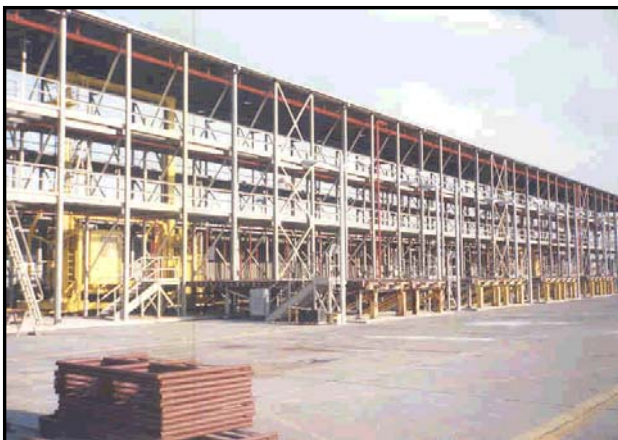
Container Storage and Retrieval Building