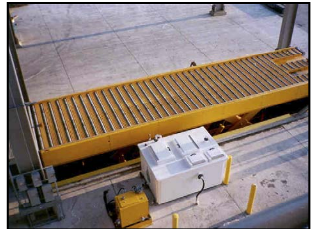
Powered Lift Roller Conveyor Interface