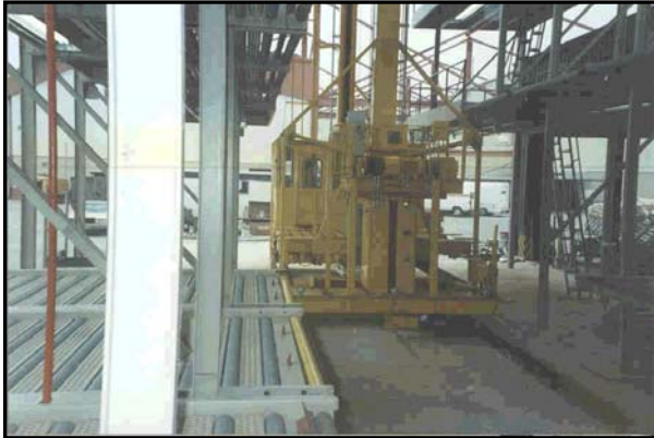
Elevating Transfer Vehicle